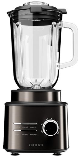
TABLE BLENDER KITCHEN SOLUTIONS